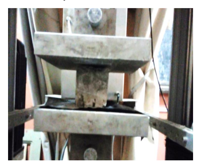
Figure 2: Determination of compressive strength of the concrete.

The concrete was removed after 24 hours of setting and samples of the concrete produced were submerged in a curing tank having water (non-magnetically treated water) and cured for 7, 14, 21 and 28 days. The samples of the concrete were tested using Universal Testing Machine (UTM, with model FT300CT by Testometric Company Limited, United Kingdom) at a speed of 10 mm/s. The compressive strength of the 100 x 100 x 100 mm cube was determined as shown in Figure 2 while the flexural strength was determined using the UTM as shown in Figure 3. In this study, all the experiments for each treatment were replicated 3 times and the mean result was obtained and presented in the results section.