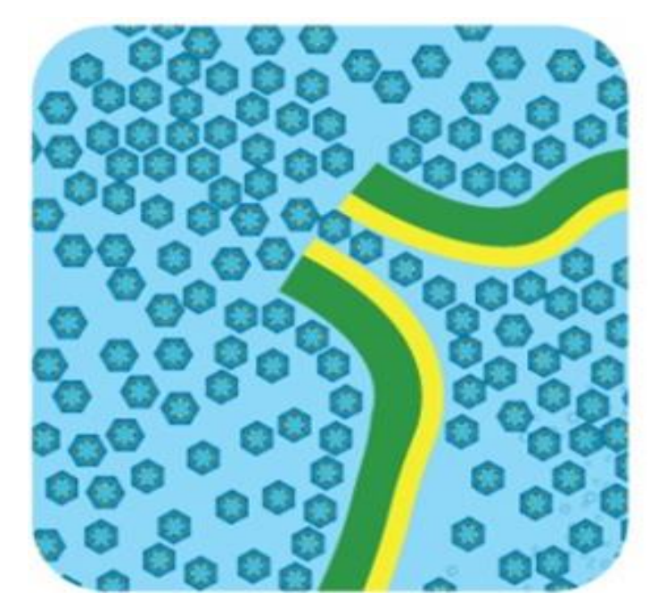
Figure 1a: Magnetized water.

The objective of this study is to determine the effect of magnetically treated water on the strength of the concrete (force at peak to break the concrete), compressive strength, flexural and impact strength of concrete produced using magnetically treated water, compare with the concrete using non-magnetically treated water. Figures 1a and 1b show water cluster of magnetically treated water and non-magnetically treated water, respectively.