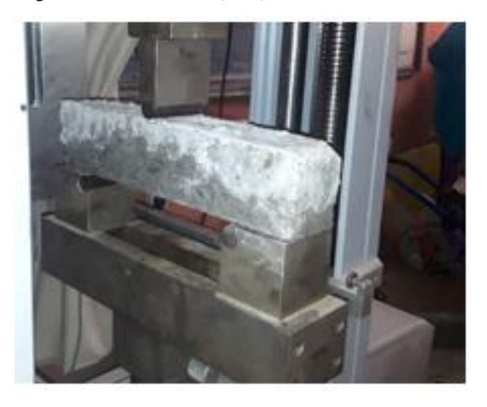
Figure 3: Determination of flexural strength of the concrete.

loudspeakers was used in this study to generate the magnetic field and the strength of the magnets was measured using the gaussmeter (Model GM-2 by Alpha Lab Inc). Circulation flow method was used in this study because it was found to be effective in producing magnetized water than the static and single flow methods Chern (2012).