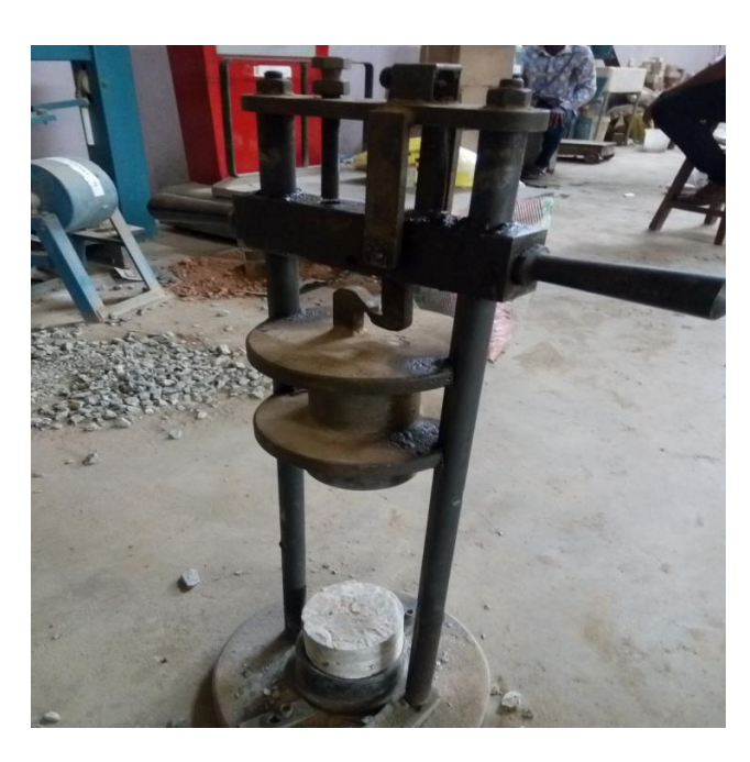
Figure 5: Aggregate impact testing machine.