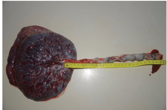
Figure 1: Measurement of cord length.

Gross examination of the umbilical cord was done within 5 min of delivery of the placenta. The umbilical cord was clamped at the foetal end and cut 5 cm from the foetal insertion with a pair of sterile scissors taking care not to milk the cord. The remaining length of the cord from the cut end to the placental insertion was then measured in centimetres (Figure 1). Five centimeter was added to the length of the measured cord. There were two observers present at each delivery. They were researcher or research assistants (investigators) and the attending midwife or doctor depending on mode of delivery. The study protocol was strictly adhered to and all measurements were taken with the same tape measure. In view of this, the expected inter/intra observer variability was negligible.